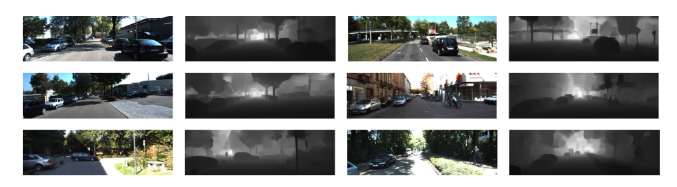
Fig. 4. More qualitative results on KITTI test splits.