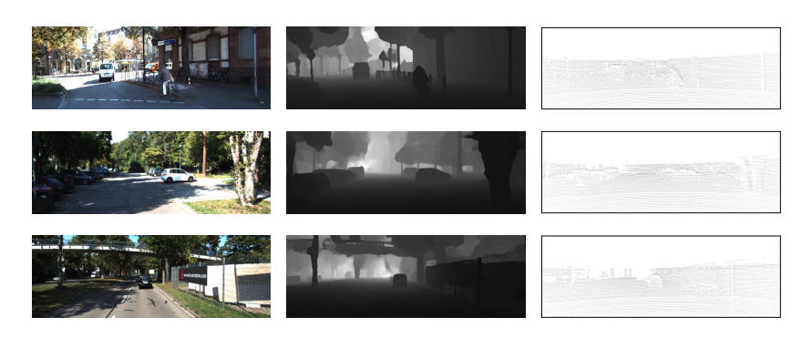
Fig. 2. Examples of the enhanced dense depth maps generated by a stereo matching model [22]. We use these depth maps as complementary data to the sparse ground truth depth maps. The left column contains RGB images, while the middle and right column show the enhanced depth maps and sparse ground truth, respectively.

layer which aggregates local depth information vertically, and a residual estimator which learns residual map for refining the coarse depth estimation from the last scale. Both the features from previous scale and the proposed vertical pooling layer are used in the residual estimator.